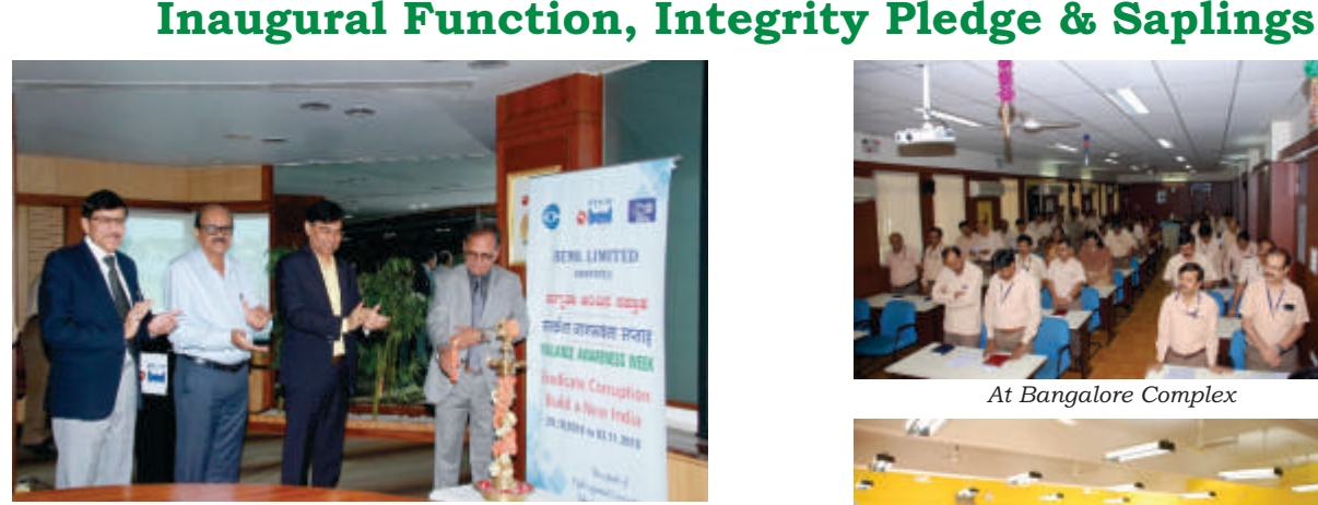
Inauguration at HQ

Integrity pledge for Citizens was also administered to the students & Staff at Schools & Colleges and Gram Sabhas.