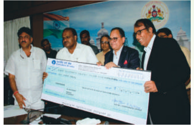
CMD presenting the cheque to Hon'ble Chief Minister, Karnataka in the presence of Hon'ble Minister for Irrigation, Kannada & Culture, GoK

BEML is always at the forefront to extend its helping hand during crisis as a part of its being a