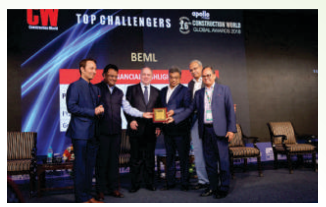
CMD receiving the Award

The Award is instituted by ASAAP Information Global Group and is awarded based on the performance evaluation – 'that grew top line and bottom line, stayed profitable and managed to keep financial health within defined limits'.