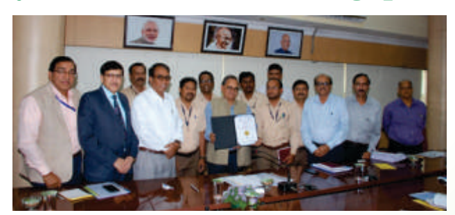
Winning team members with CMD and Directors.

The process optimization was carried out using Taguchi Methodology. Using this process bogie frames are manufactured at BEML at par with international standards which has been approved by Delhi Metro Rail Corporation. This has helped