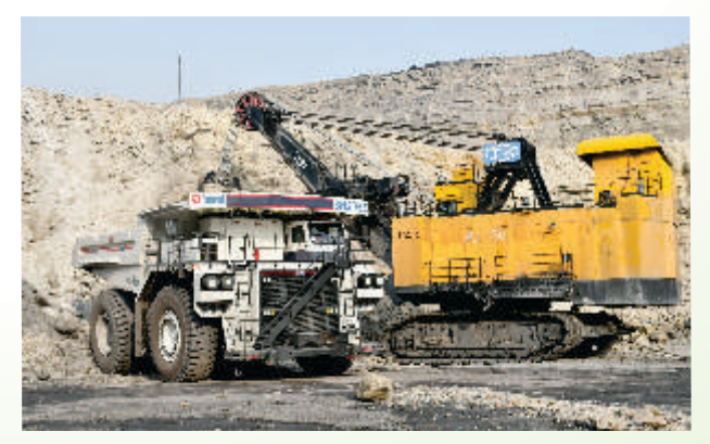
BEML 205E Dump Truck in action

BEML has a major market share in the Heavy Earth Moving Machineries, deployed at NCL and thus plays a pivotal role in achieving the NCL's coal production target.