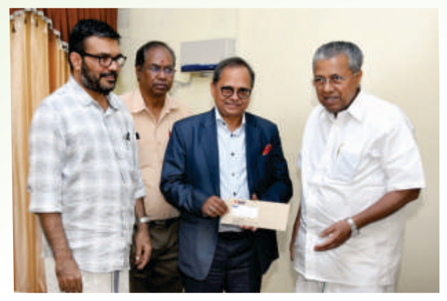
CMD presenting the cheque to Hon'ble Chief Minister, Kerala

BEML contributed ₹.1. Cr. each to Chief Ministers's Relief Fund for the flood affected people of Coorg, (Karnataka) and Kerala. The employees and officers of BEML donated their one day salary towards this noble cause.