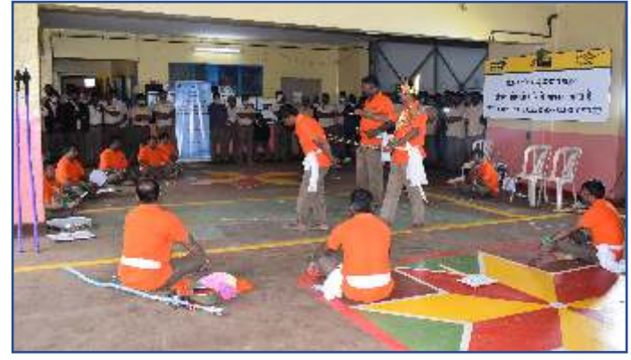
Creating awareness through skit