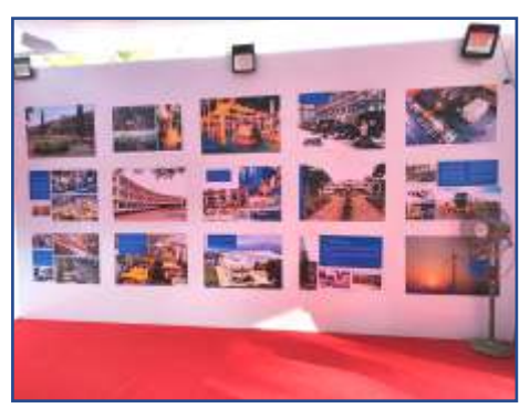
Display of BEML Contributions

Apart from this, equipment manufactured by BEML such as Dozers, Dumpers, Heavy Duty Trucks and Ultra Modern Metro Coach (only in B'lore) were on display.