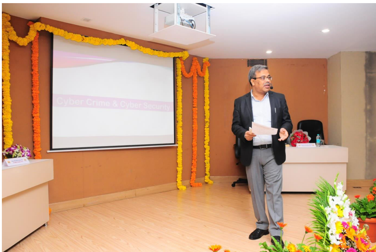
Key-note address by Shri Sanjay Sahay, IPS