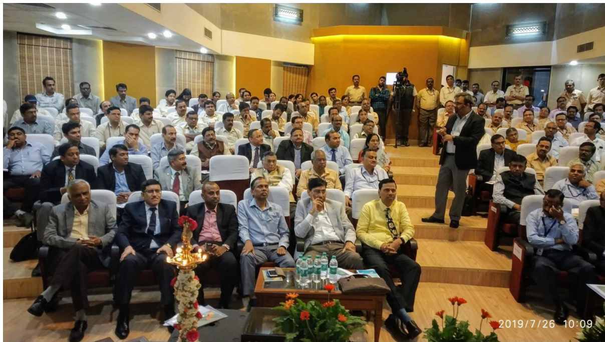
Key-note address by Shri Sanjay Sahay, IPS