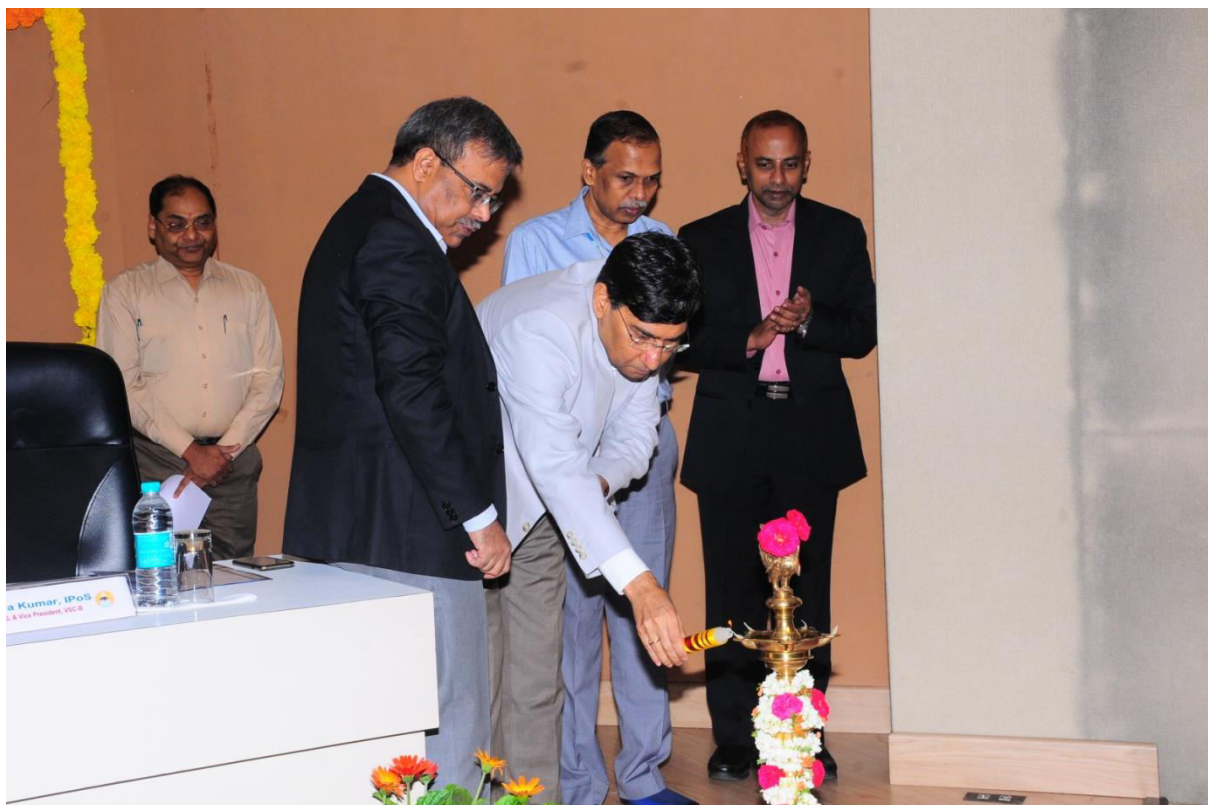
Inauguration by lighting up the lamp by the dignitaries