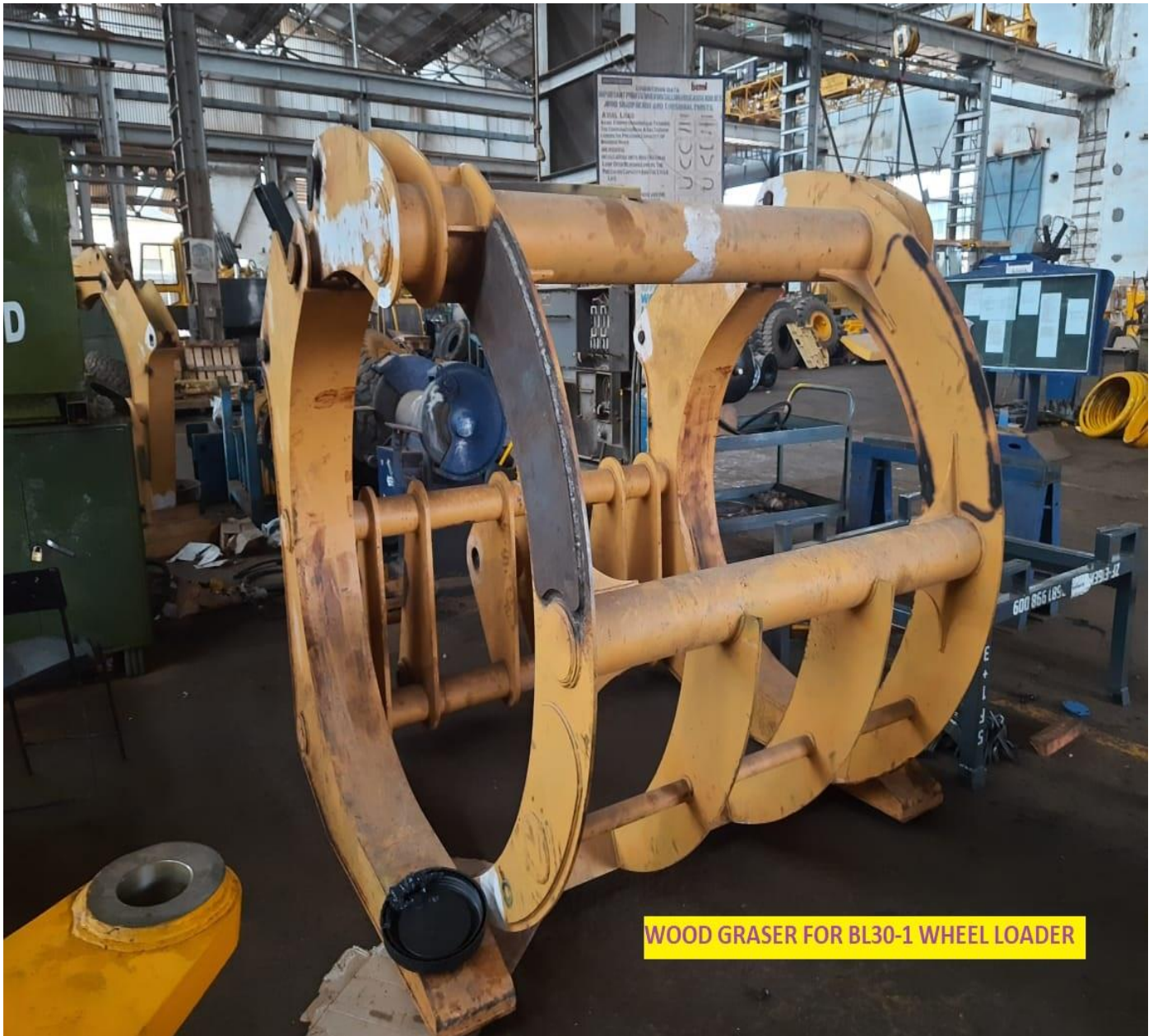
WOOD GRASER FOR BL30-1 WHEEL LOADER

(A Govt. of India Mini Ratna Company under Ministry of Defence) “BEML SOUDHA”, 23/1, 4th Main, S. R. Nagar, BANGALORE – 560 027